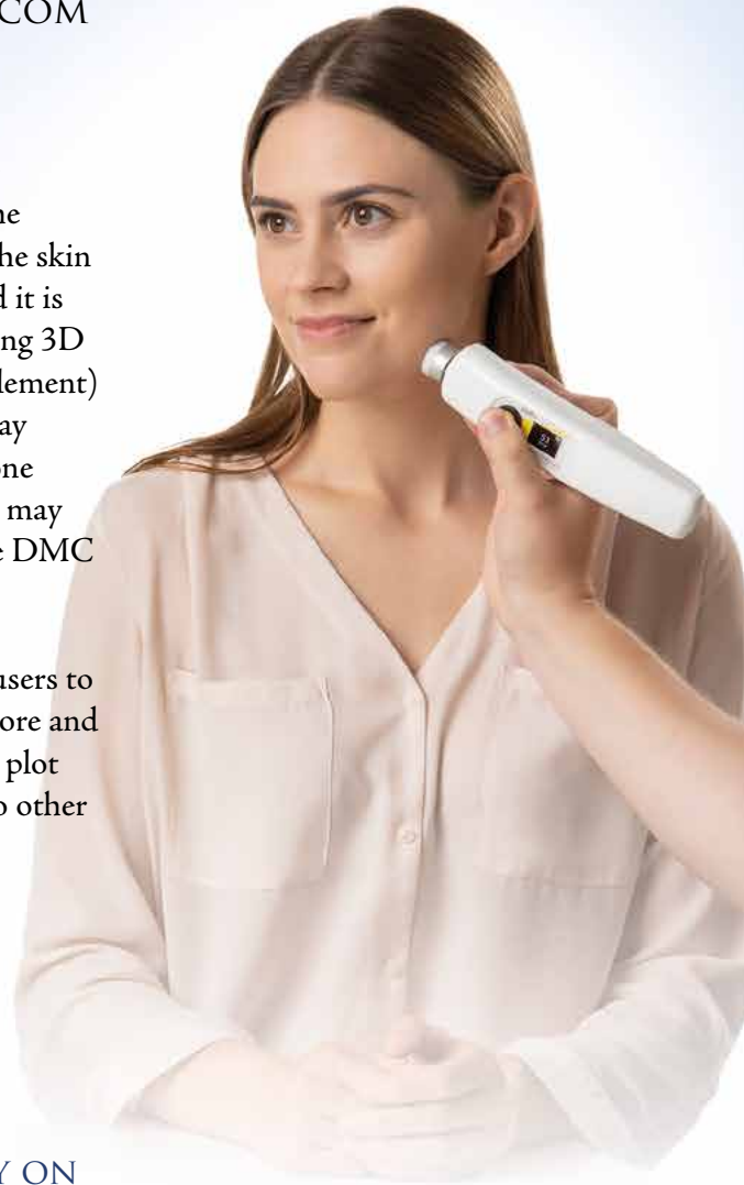
ELASTICITY ON DIFFERENT SKIN SITES

The DMC software allows users to set up individual projects, store and view measurement data and plot the results or export them to other programs for editing.